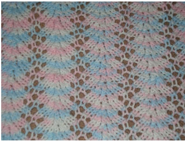
Wandering Vine Lace